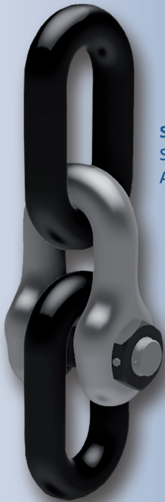
Shackle - 120 mm Studless Link Assembly